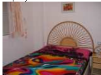
Property in Torrelamata - For Sale