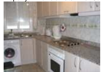
Property in Torrelamata - For Sale