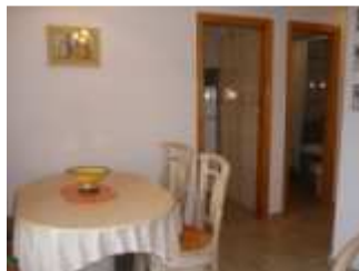
Property in Torrelamata - For Sale