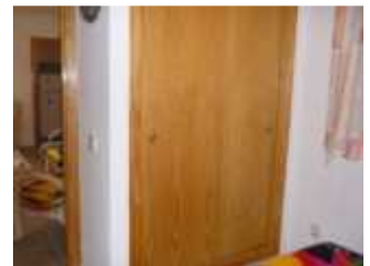
Property in Torrelamata - For Sale