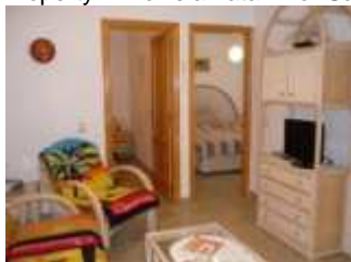
Property in Torrelamata - For Sale