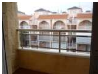
Property in Torrelamata - For Sale

Top floor two bedroom 1 bathroom apartment. Only minutes walk to the beach of Torrelamata New style of property. Sold with furniture, as seen. Apartment ideal for the beach holidays, or permanent living. The beach is only a 1 minute walk. There is a private sun terrace on the roof. Contact us for more information..... here To arrange a viewing or call (0034) 667 669 218