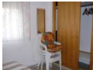
Property in Torrelamata - For Sale