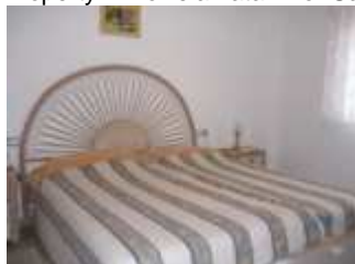
Property in Torrelamata - For Sale